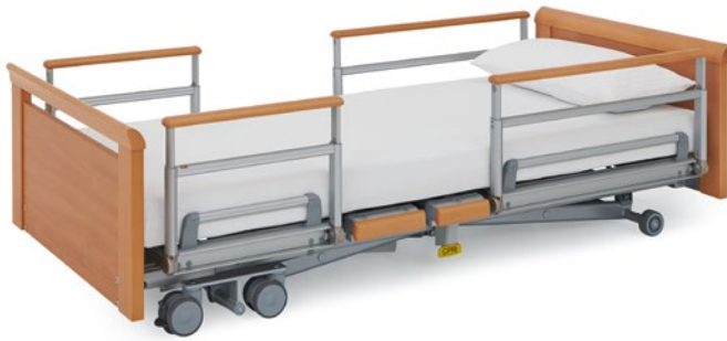
Model 5384 Kepler